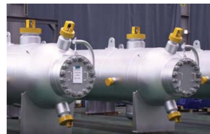
Fuel Gas Heater