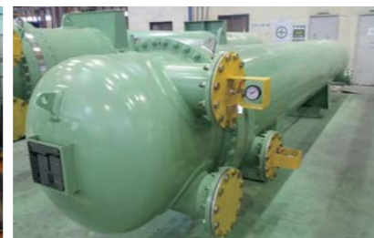
Lube Oil Cooler