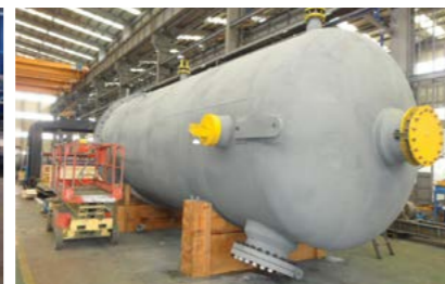
Turbine Cooling Air Cooler