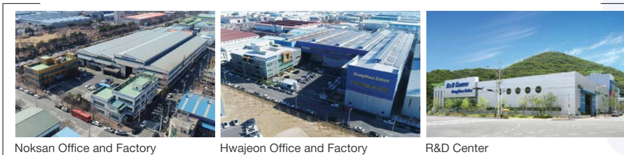
Noksan Office and Factory Hwajeon Office and Factory R&D Center