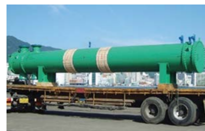
Closed Cooling Water Cooler (CCW)