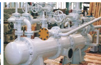
Ejector Vacuum System