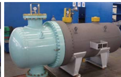
Fuel Gas Heater After Cooler